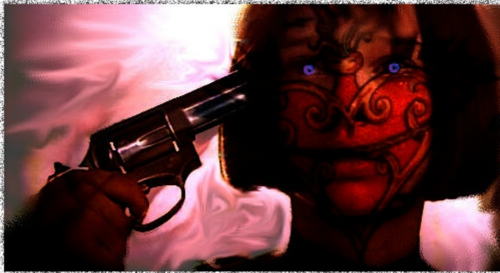
~::~Gunhead 2 by Peter Amthor::~~

Originally, Moloch was the name of an ancient god. This god is mentioned in the Bible, and he is also known by many permutations of this name. 'Moloch' is a rather modern rendering of the original name which has been lost in the recesses of time.