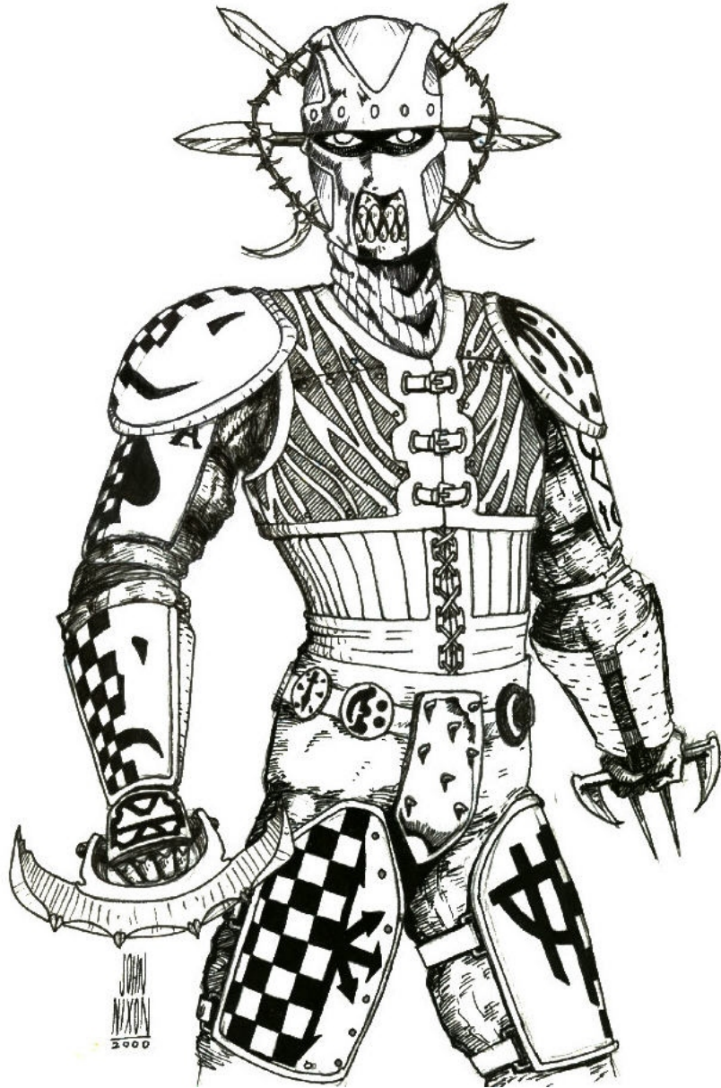
SK2 by PeterAmthor

Initiative Bonus: none Damage Bonus: +8 Damage Capacity (damaged like a vehicle): 6 light damages = 1 medium damage 5 medium damages = 1 heavy damage 3 heavy damages = 1 deadly damage (takes 2 deadly damages before being destroyed) Endurance: 135 Natural Armor: 8 (from metal hull) Powers: Invulnerable to Radioactivity, Telepathy, Telekinesis Attack Modes: Telekinesis, *Pollution, Turbofan (scr 1-2, lw 3-5, sw 6-9, fw 10+) Home: Boeing Scrap Yard A35 Notes: *Pollution rules (as stated in the Lore of Cybertechnology q.v.) POT 1d5 per week, cumulative. Attribute losses are permanent but total (not cumulative) CON=2/3-Weakness, coughing & shortness of breath. Dry feeling on skin CON=1/2-Asthma-like symptoms, mucus. Skin irritation; mosquito-bite like spots and mild rashes appear. (-2 COM and CON) CON=1/3-Serious hacking coughs, symptoms of longtime cigarette smoking and asthma. Most likely bedridden. Skin appears as if badly sunburned with wide rashes. (-5 COM and CON) CON=0-Victims flesh peels and rots. Terrible itching; maggots may breed in the wounds. Bloody hacking coughs; lung cancer; tuberculosis. Death if CON is brought to zero (-10 COM and CON)