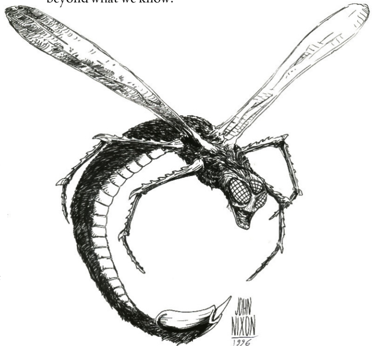
Bug by Peter Amthor

**** It has been speculated that the Nilindroths are an aspect of a fractal reality. Each creature is only a mathematically exponential exact smaller or larger copy of the other creatures. Their size may expand to the sub-atomic or above our 3-dimensional reality. This would seem to link them with aspects of radioactivity and Time/Space beyond what we know.